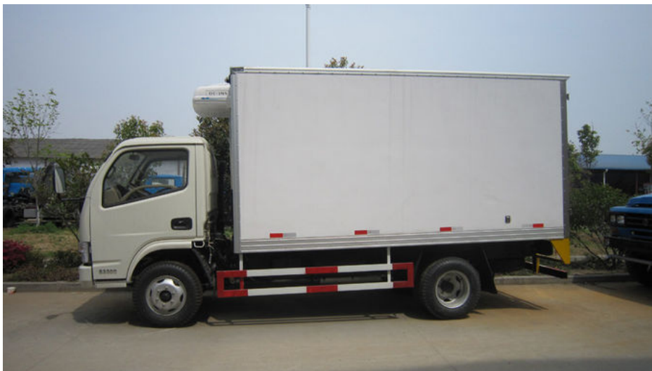
8 cm Van Body Thickness